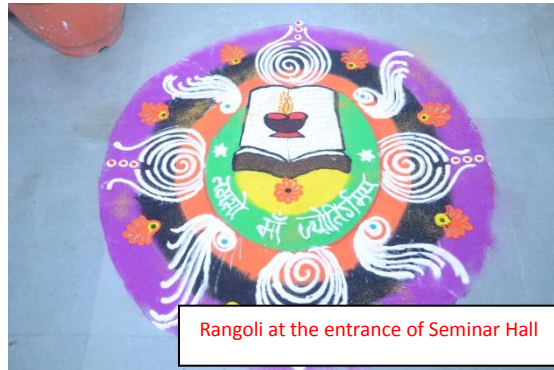
Rangoli at the entrance of Seminar Hall