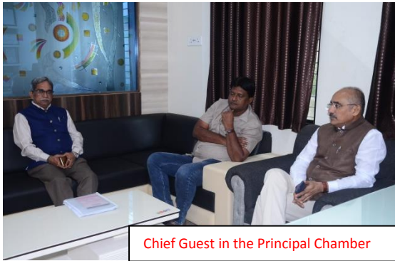
Chief Guest in the Principal Chamber