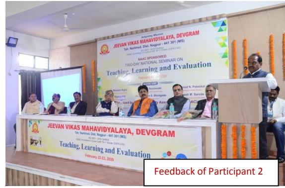
Feedback of Participant 2