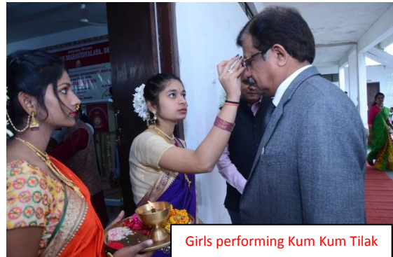
Girls performing Kum Kum Tilak