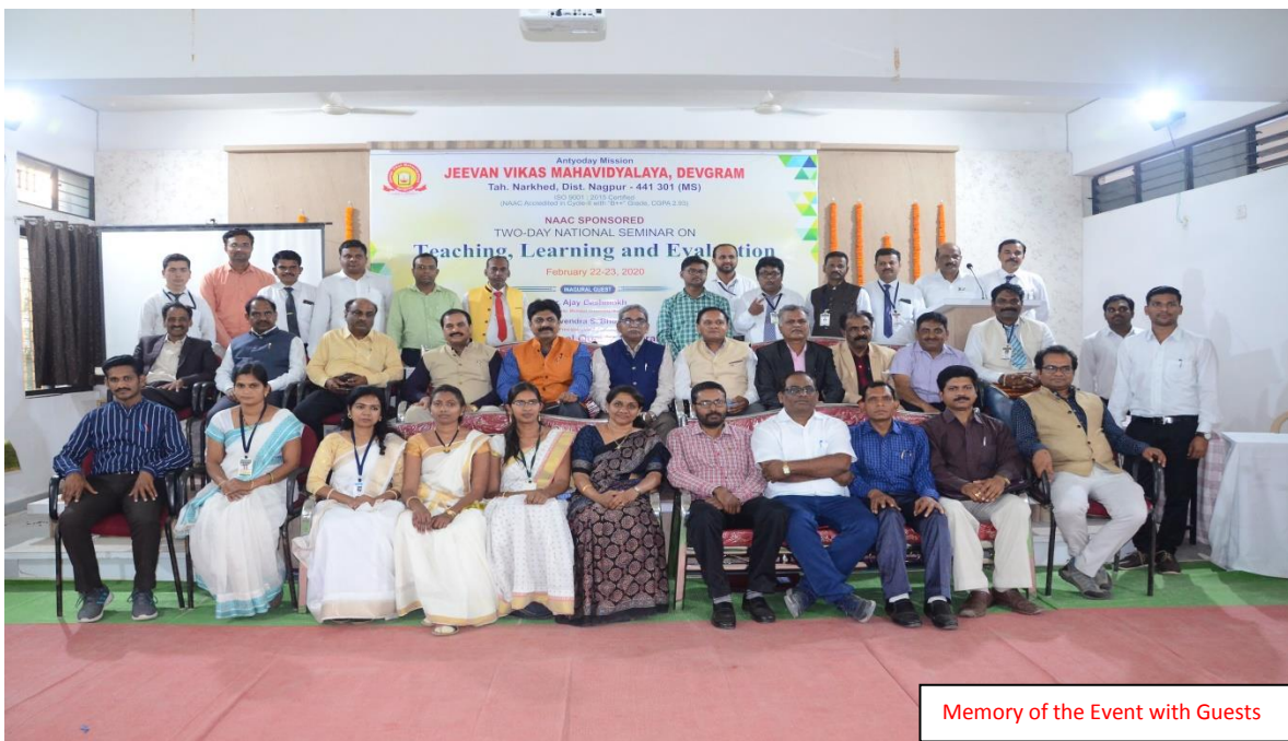
Memory of the Event with Guests