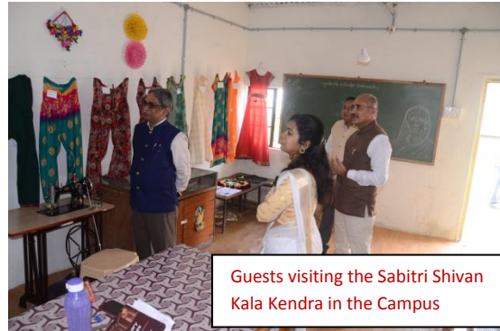
Guests visiting the Sabitri Shivan Kala Kendra in the Campus