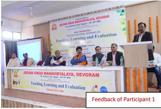
Feedback of Participant 1