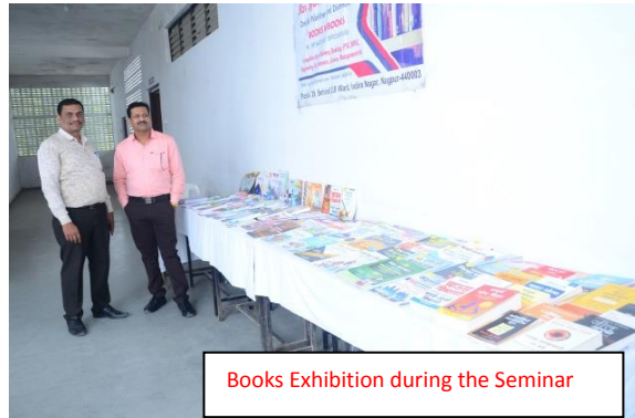
Books Exhibition during the Seminar