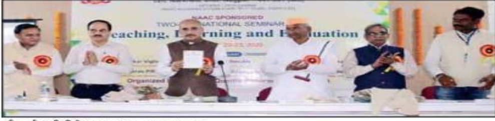
ई-जर्नल सीडीचे प्रकाशन करताना मान्यवर