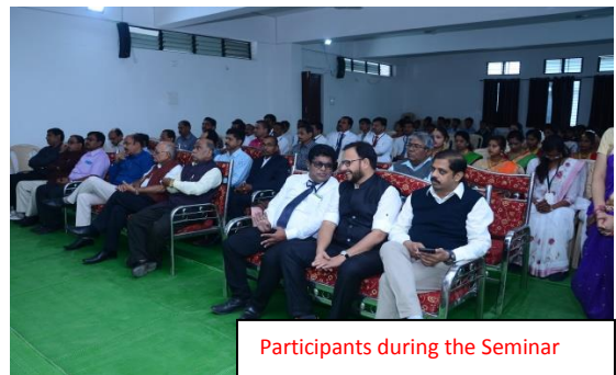
Participants during the Seminar