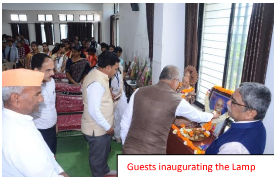
Guests inaugurating the Lamp