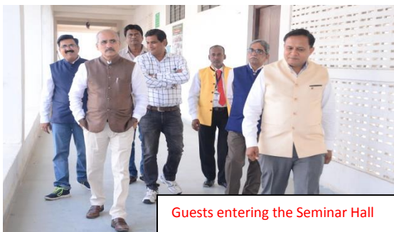
Guests entering the Seminar Hall