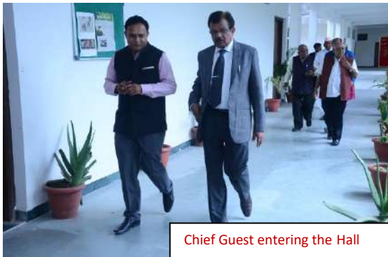
Chief Guest entering the Hall