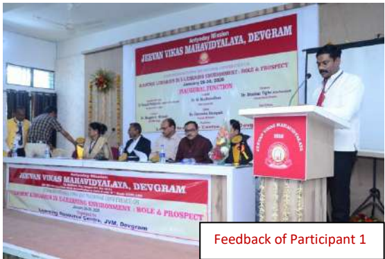
Feedback of Participant 1