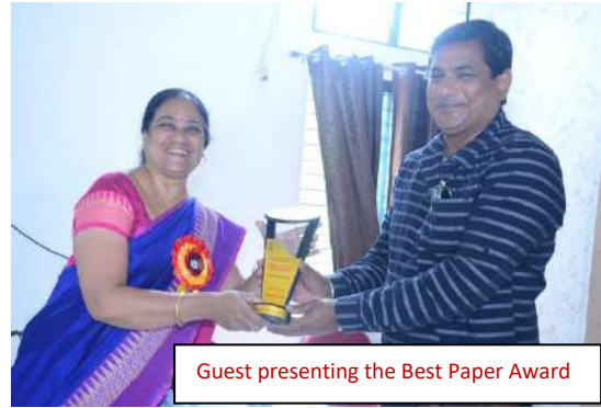
Guest presenting the Best Paper Award