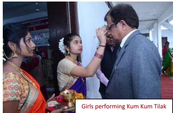
Girls performing Kum Kum Tilak