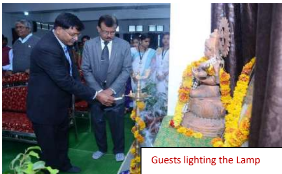
Guests lighting the Lamp