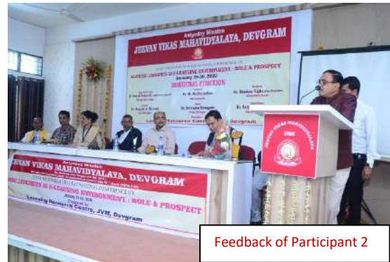
Feedback of Participant 2