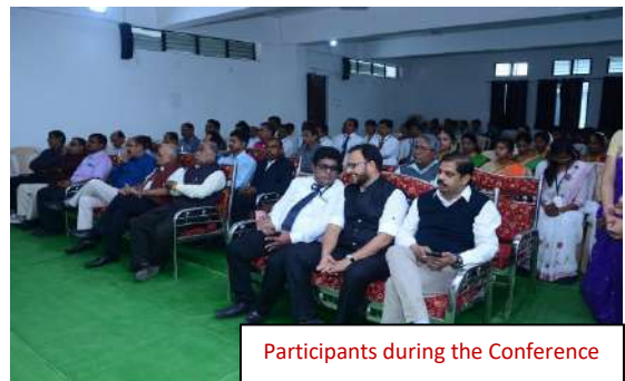
Participants during the Conference