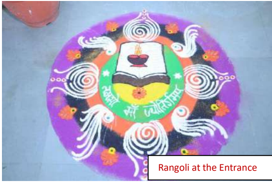
Rangoli at the Entrance