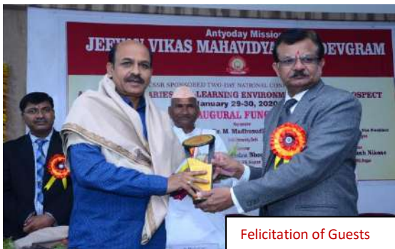
Felicitation of Guests