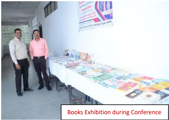
Books Exhibition during Conference