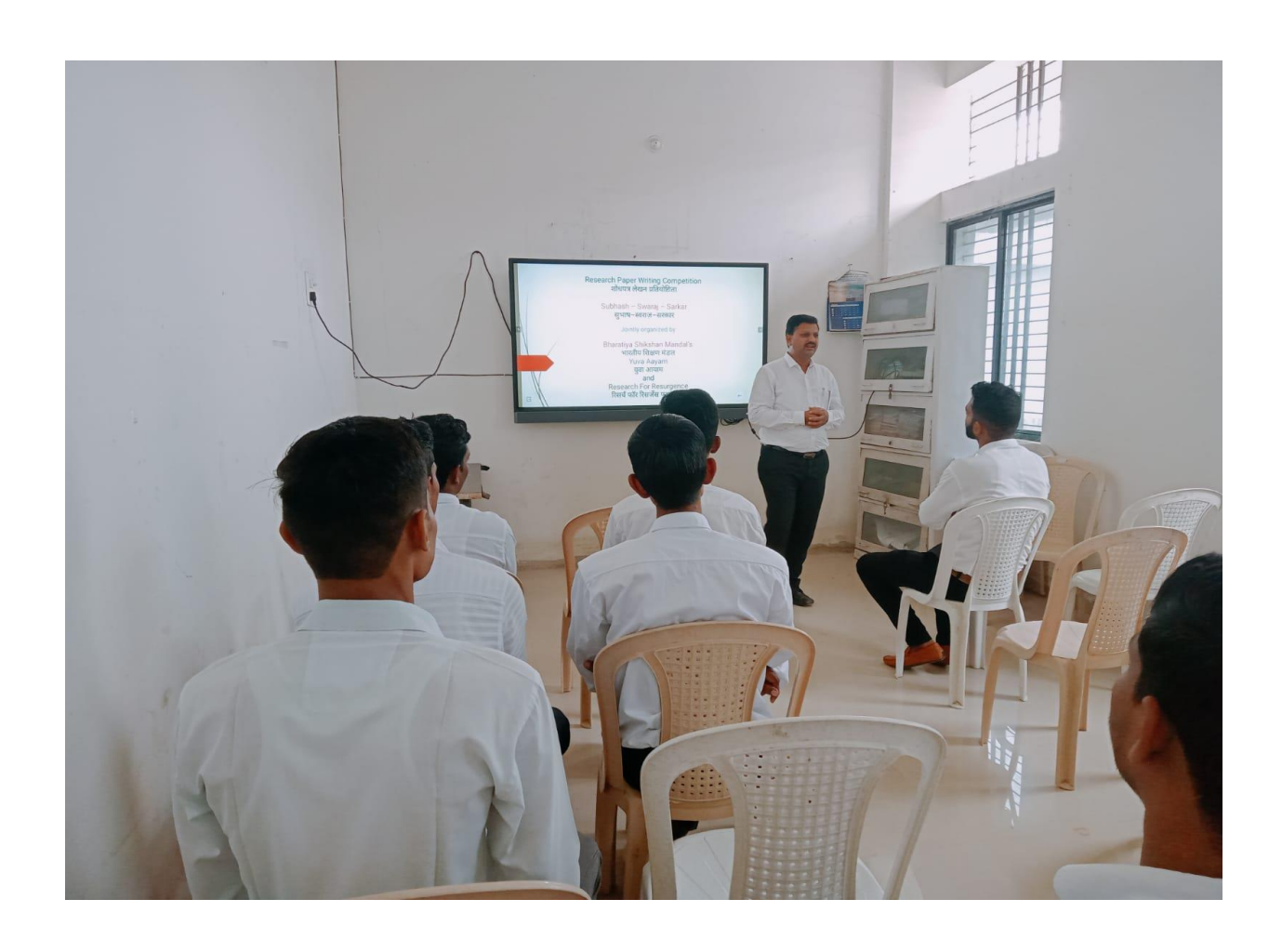
Link of Recorded Video