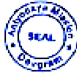
President Antyodaya Mission Devgram Ta. Narkhed, Dist. Nagpur

We wish you success in your research endeavors.